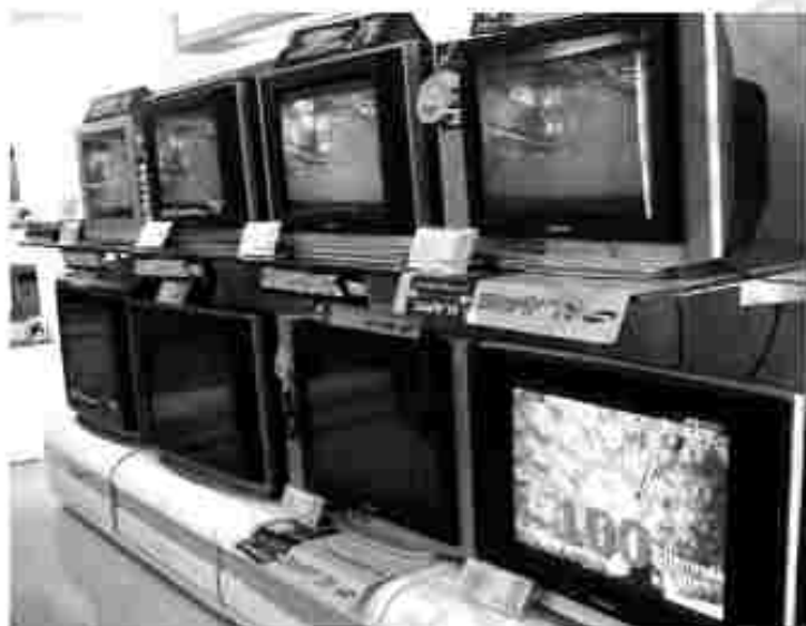
A television showroom

In 1991 there was one state controlled TV channel Doordarshan in India. By 1998 there were almost 70 channels. Privately run satellite channels have multiplied rapidly since the mid-1990s. While Doordarshan broadcasts over 35 channels there were about 900 private television networks broadcasting in 2020. The staggering growth of private satellite television has been one of the defining developments of contemporary India. In 2002, 134 million individuals watched satellite TV on an average every week. This number went up to 190 million in 2005. The number of homes