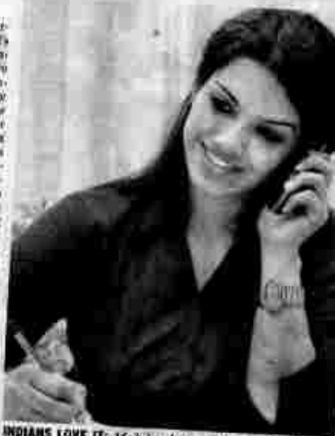
INDIANS LOVE IT: Mobile phones are popular but costlier services like Net phone are shunned. Women are champion text messengers.

We love short messaging services, indeed 100 per cent